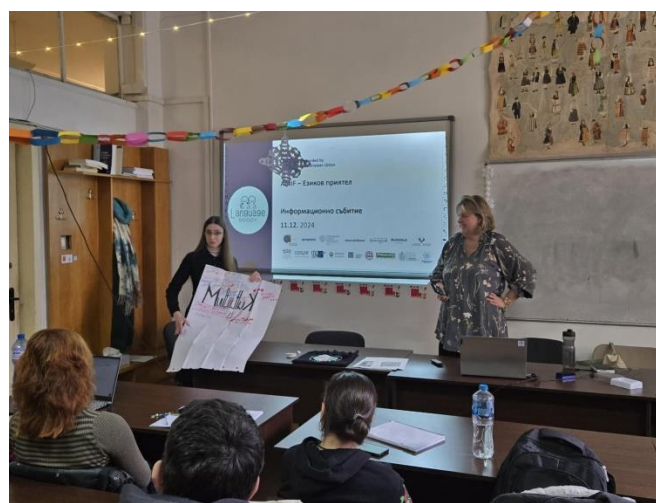
(Moments of the Language Buddy Launch Event at Sofia University St. Kliment Ohridsky, Sofia, Bulgaria)

The events attracted over 170 participants , including students, public authorities, academic representatives, and community members. Attendees actively engaged in discussions, shared their experiences, and expressed strong commitment to the project's objectives.