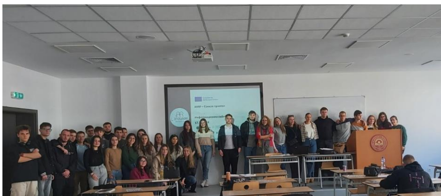
(Moments of the Language Buddy Project at University of National and World Economy, Sofia, Bulgaria)

The initiative was launched on November 13, 2024, at the American University in Bulgaria, Blagoevgrad. Subsequent events were held at Sofia University St. Kliment Ohridski, the University of National and World Economy (UNWE), and online via the Distance Learning Centre at UNWE in Haskovo, Bulgaria. Events at UNWE were supported by Multi Kulti representatives - NGO key partner and attracted over 100 stakeholders.