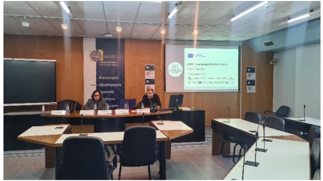
Some photos from the event

Feedback received included the following: